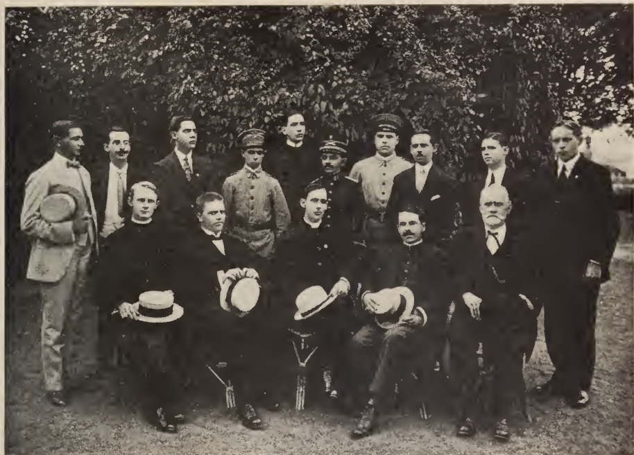
THE FACULTY OF THE SOUTHERN CROSS SCHOOL